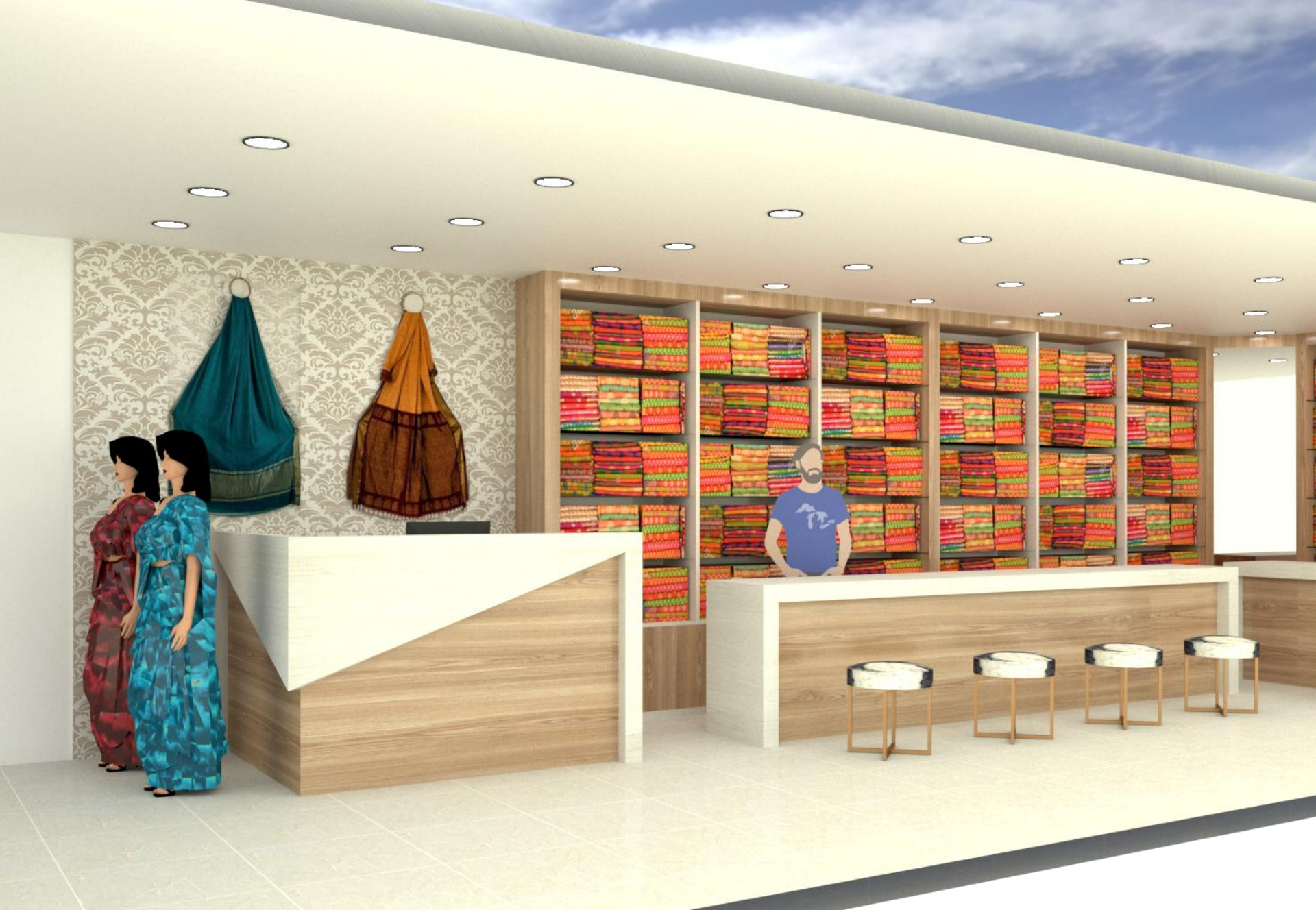
REFERENCE 3D VIEW